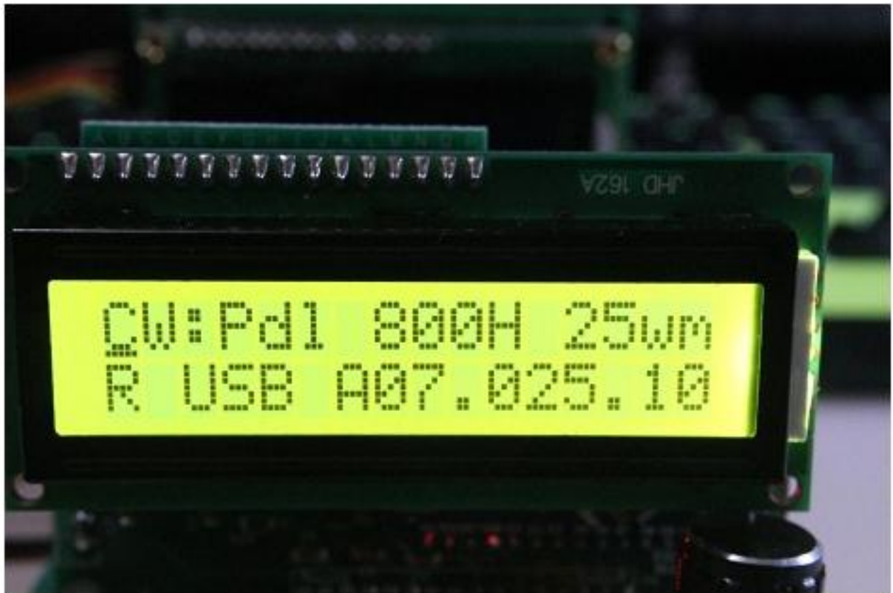
Initial Menu Display

Press the encoder button until "Menu" is displayed. Immediately release the encoder button and a display full of changeable items will display.