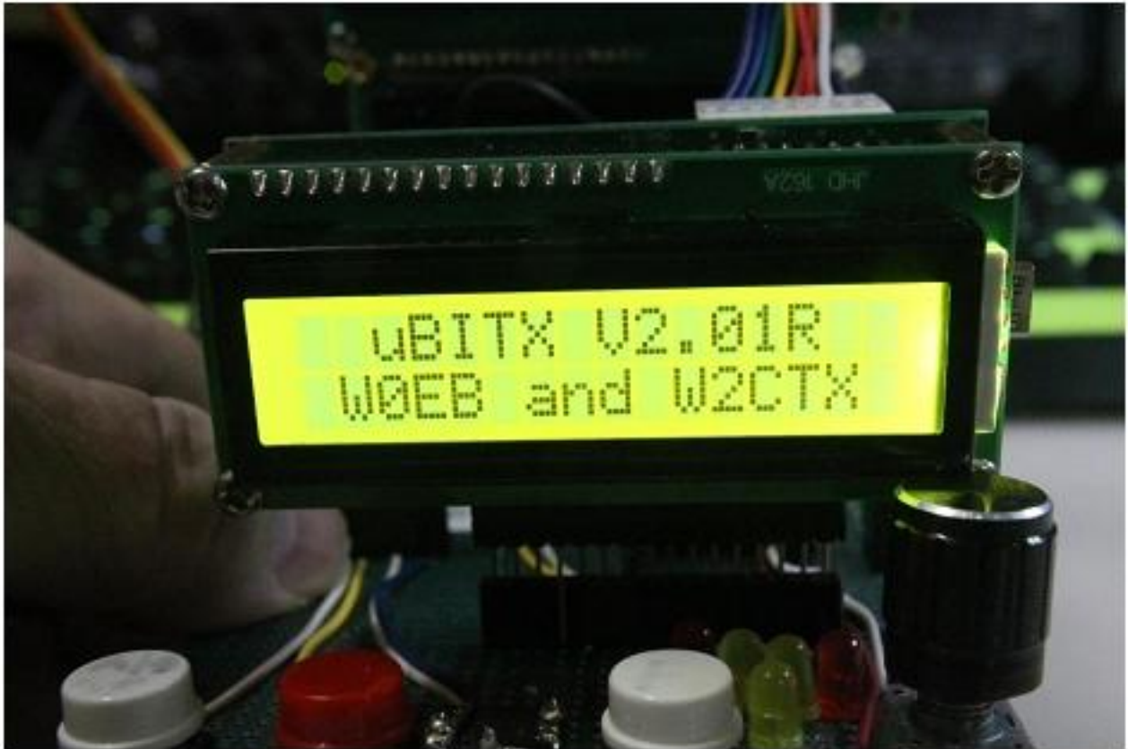
Software running on W0EBns Test Platform.

Instructions for uBITX Version 2.02R software written by Ron Pfeiffer, W2CTX and Jim Sheldon, W0EB, including the minor hardware changes needed to make it work properly.