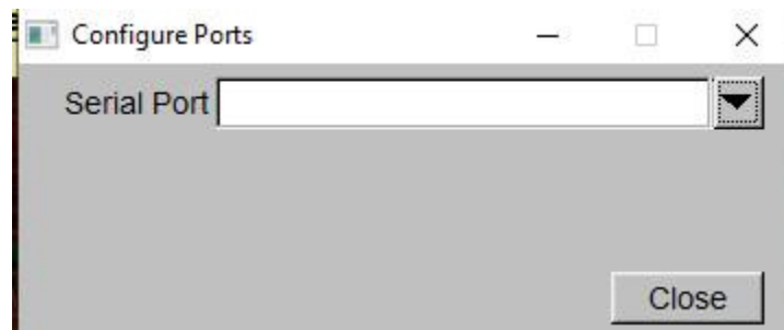
Serial Port selection box.

When you execute the program TSWSETTIME.exe you will see the following initial screen: